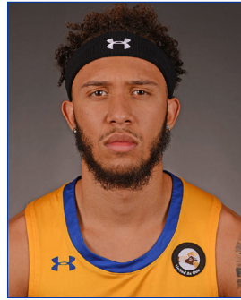
#1 Tucson Redding